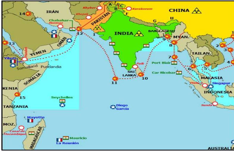
Figure-5: Chinese Ports in the Indian Ocean Region