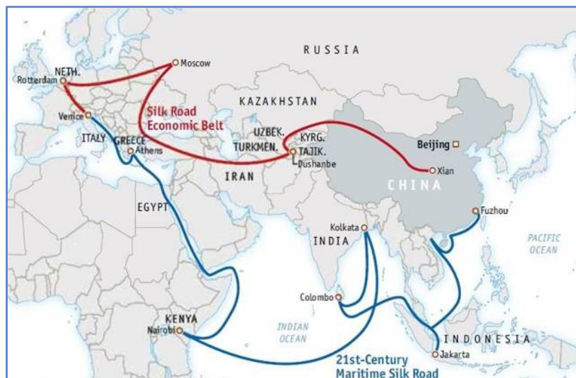
Figure-4: Belt and Road Initiative (BRI)

Europe including Oceania and Africa as well. 38 All the BRI projects receive financial support from the Chinese Silk Road Fund and the Asian Infrastructure Investment Bank (AIIB). 39