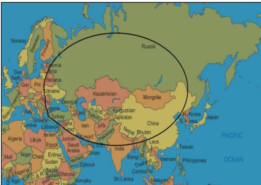
Map-1.4: Pakistan - The Zipper of Regions