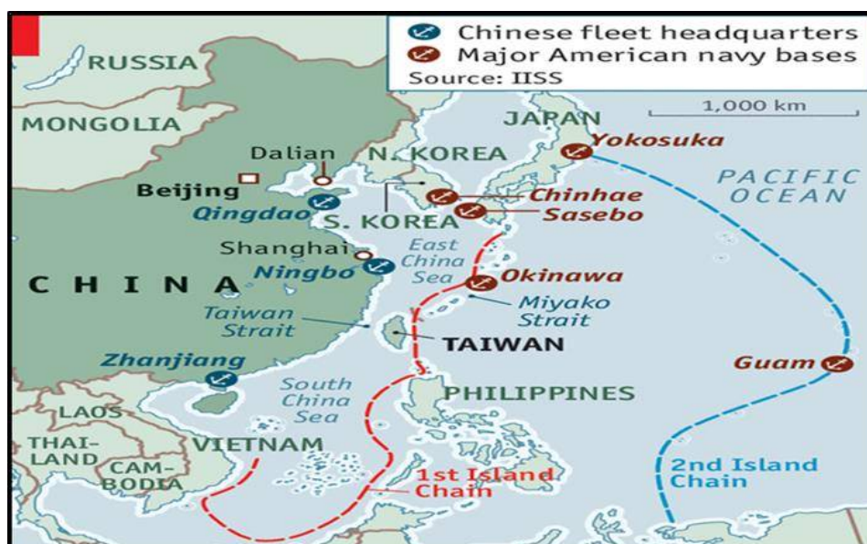
Figure-3: Naval Bases of the US and China in Pacific Ocean

Meanwhile, stationing 2500 US marines at Australian base Darwin in 2011 as part of the Obama Administration's Pivot to Asia strategy has further solidified under Trump administration. Australia will continue hosting US troops until 2040. 28 Figure-3 shows the architecture of the US and China naval bases in the Pacific Ocean.